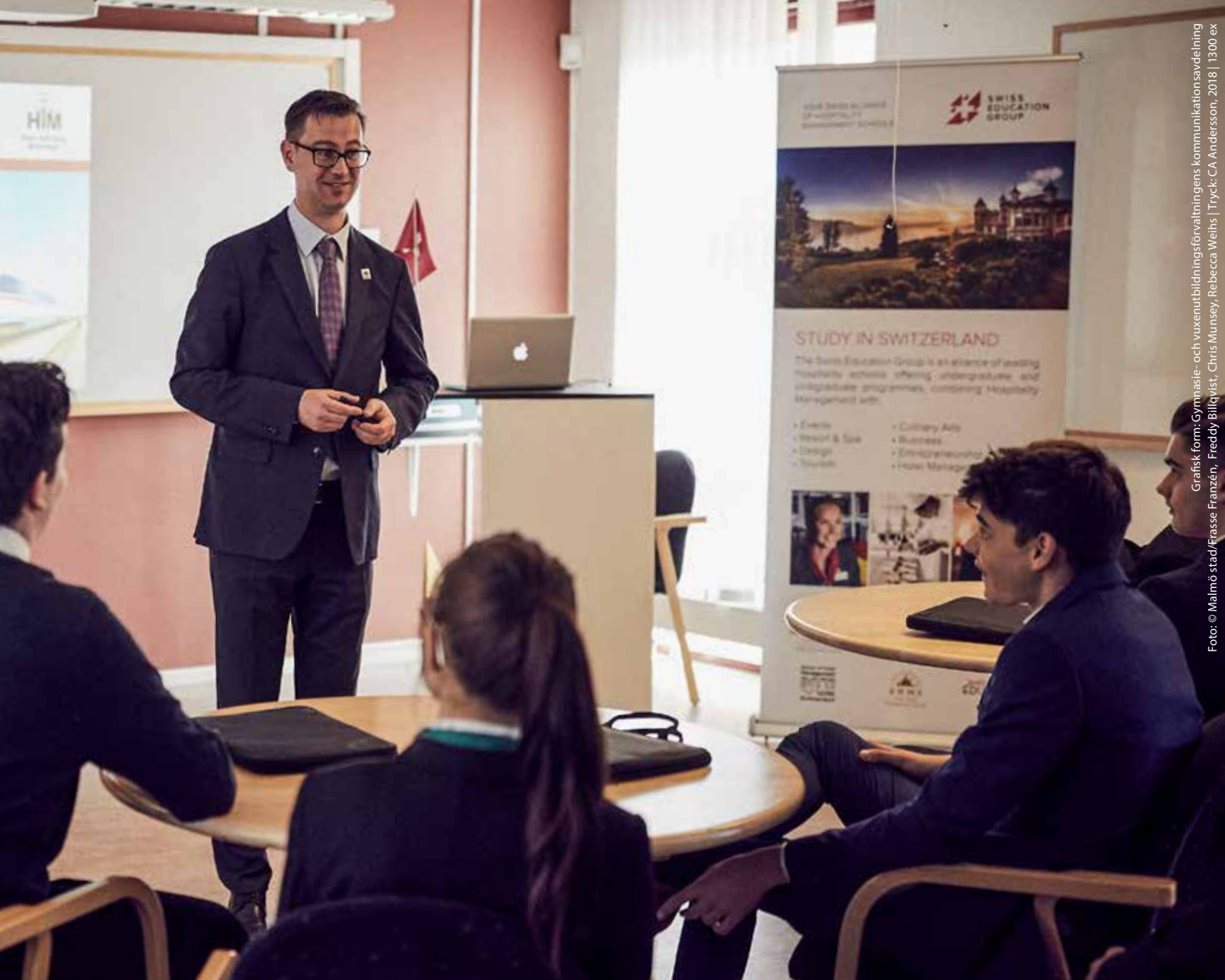
Grafisk form: Gymnasie- och vuxenutbildningsförvaltningens kommunikationssavdelning | Tryck: CA Anderson, 2018 | 13000 ex